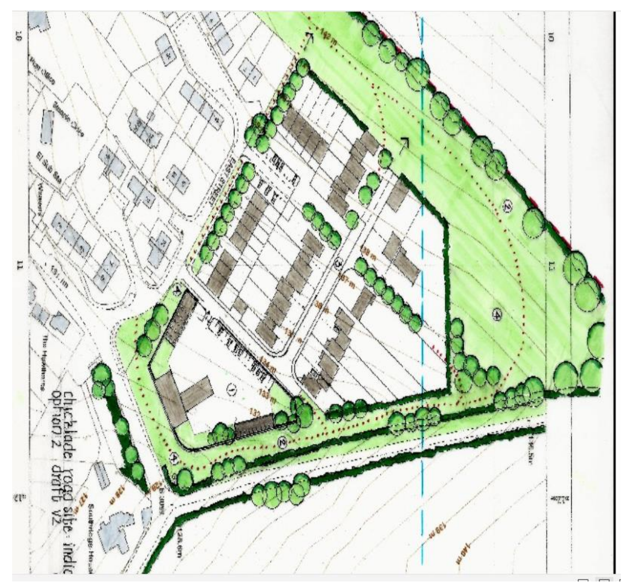
Indicative plan of the site as shown in the Hindon neighbourhood plan.